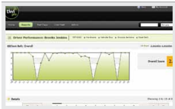
The tiwiPRO web portal provides immediate reports of driver performance including seat belt usage, speeding violations and driving behavior.

CONTACT INTHINC NOW AT 801-886-2255 sales@inthinc.com