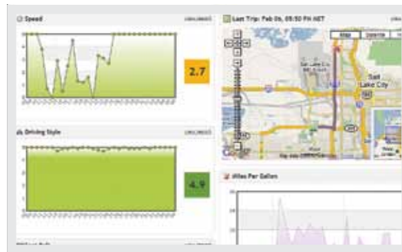
Information is instant and easy to use, including a range of valuable graphics and real-time data.