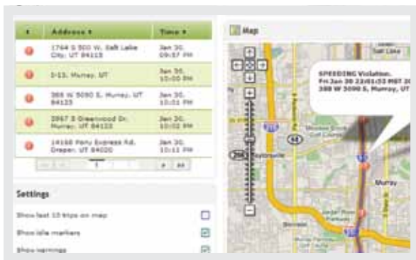
Detailed incident information is displayed and can be sent instantly via e-mail, text message or phone